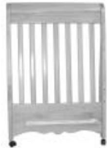
Right Side Assembly