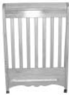
Left Side Assembly