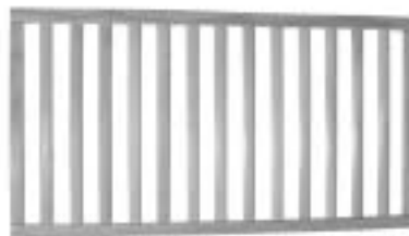
Stationary & Drop Side